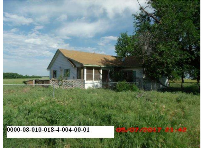
Image ID 5638 Image Date 8/16/2019

F:\pictures\0000-08-010-018-4-004-00-01.JPG