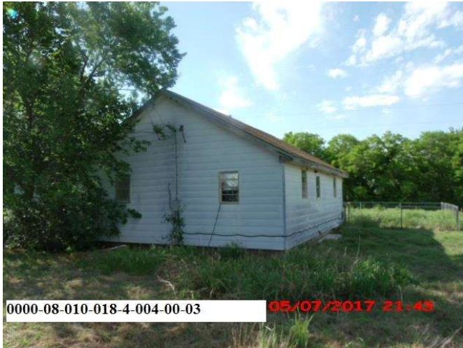
Image ID 5639 Image Date 8/16/2019

F:\pictures\0000-08-010-018-4-004-00-03.JPG