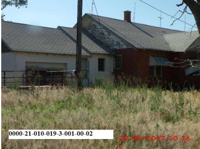
Image ID 6111 Image Date 8/16/2019

F:\pictures\0000-21-010-019-3-001-00-02.JPG