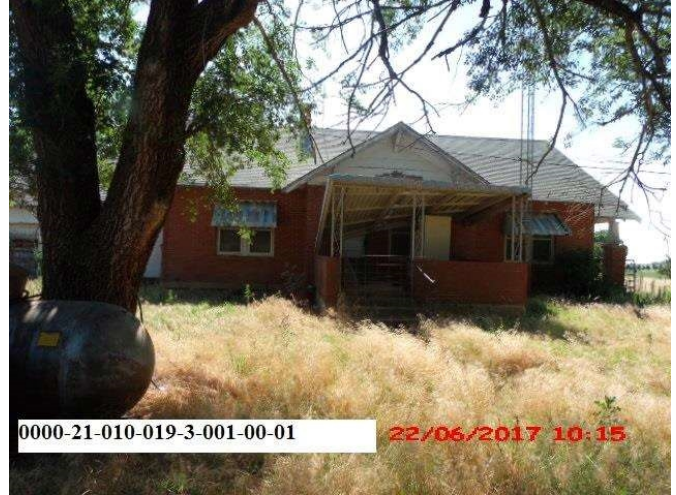
Image ID 6112 Image Date 8/16/2019

F:\pictures\0000-21-010-019-3-001-00-01.JPG