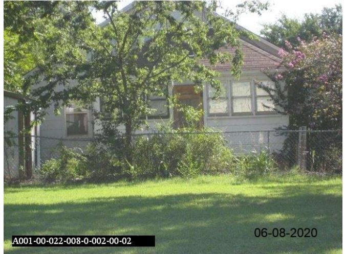
Image ID 10066 Image Date 6/29/2020

Sketch Image. Saved : 10/30/2020 07:44:51P