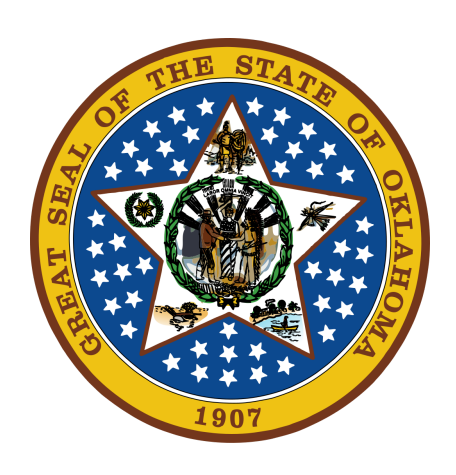
1217 N Cook